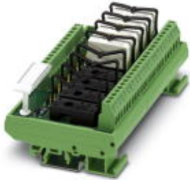
VARIOFACE module, for 8 plug-in miniature relays or miniature optocouplers, with LED, 110 V DC input voltage

Please be informed that the data shown in this PDF Document is generated from our Online Catalog. Please find the complete data in the user's documentation. Our General Terms of Use for Downloads are valid ( http://phoenixcontact.com/download )